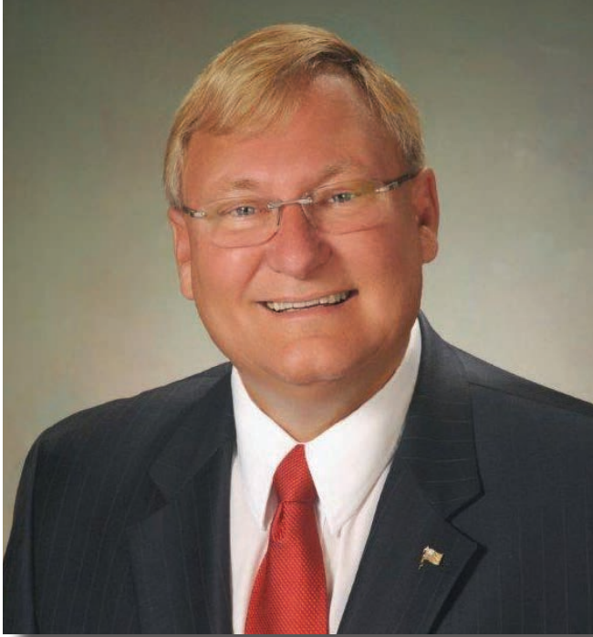
District 21 (R-Racine)